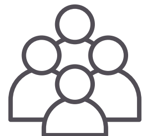
FRIENDS & FAMILY DISCOUNT