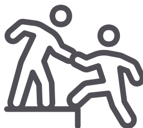
COMMUNITY SERVICE PAY