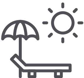
PAID TIME OFF